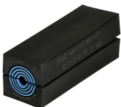
RM UG™ module with Multidiameter™